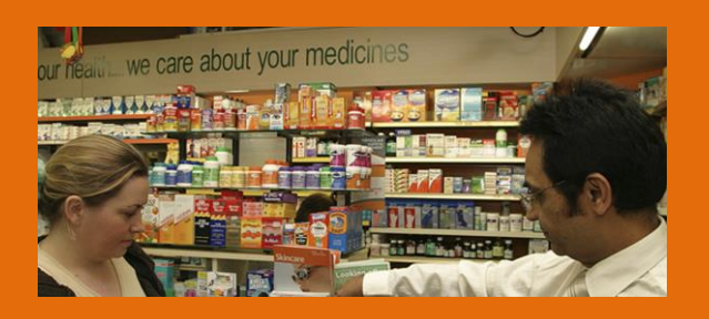
Most pharmacies now have a private consultation area, so you can discuss your health issues in confidence and you don't need to make an appointment.

Pharmacists are fully qualified to advise you on the best course of action when you start to feel unwell, and this can be the best and quickest way to help you recover and feel healthy.